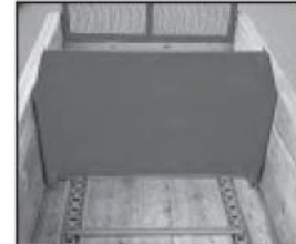
Edge with chain feed