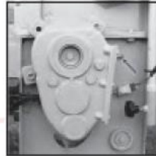
Engine for hydraulic chain