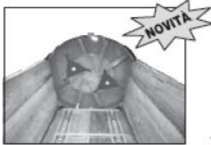
Spreader with SUPER "S" special rotator